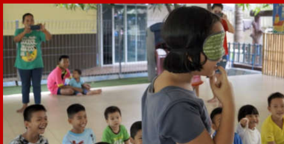
Above: Drama games to teach about using their senses.