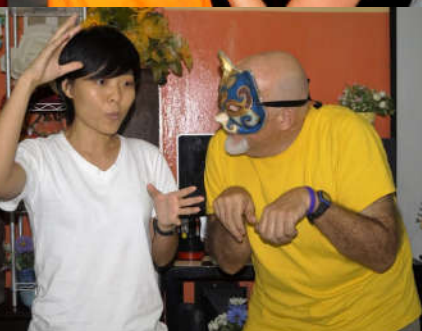
Left: learning about focus and how to avoid stage fright.