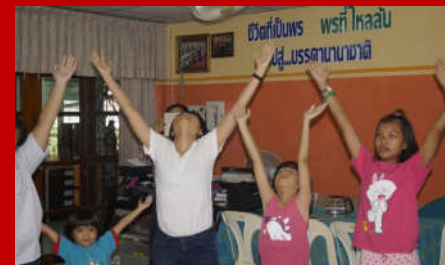
Above: Praise warm-ups