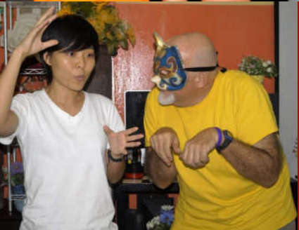
Left: learning about focus and how to avoid stage fright.