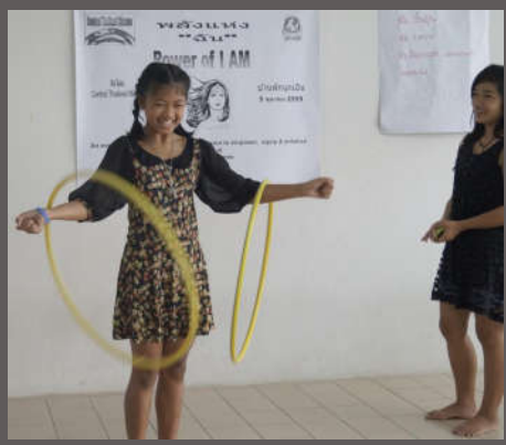
Above: Performing a skit with the Theme of "I am a winner".