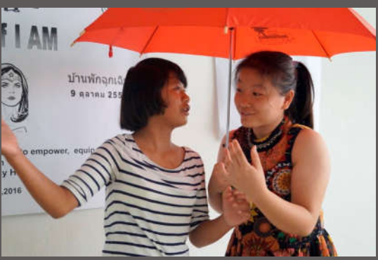
Above: Performing a skit with the Theme of "I am protected".