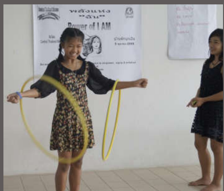
Above: Performing a skit with the Theme of "I am a winner".