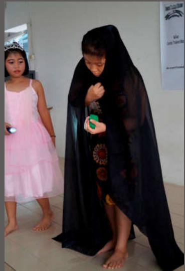
Above: Performing a skit with the Theme of "I am valuable".