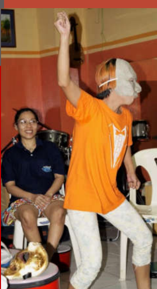
Above left and right: Using masks and hats to convey emotions and meaning. Left: Using props to tell a story.

We have had a very active week in Bangkok working with Central Thailand Mission's project partners -- the Thanksgiving Home (23 developmentally-challenged kids, needy youth), the House of Blessing (kids born in prisons or stigmatized/abandoned), and the Emergency Home (a protective shelter for those who have suffered from abuse, domestic violence, or rape). Our theme for our activities was "I Am". The goal was to instill a sense of self worth in the women and children. We used simple object lesson stories to illustrate various themes such as a bouncy ball to show resiliency (bouncing back), umbrella— protection, diamond—valuable, mirror—that they are beautiful.