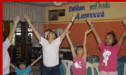
Above: Praise warm-ups