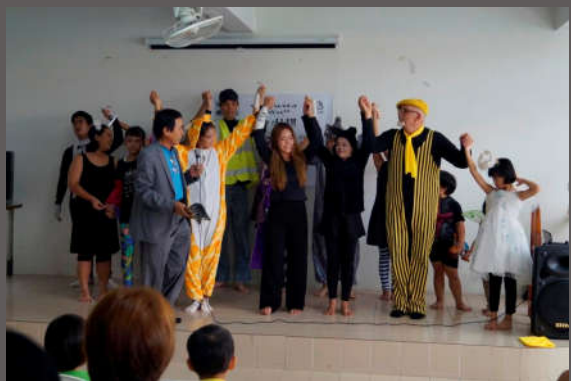
Above: Taking a bow with the cast from Thanksgiving Home.