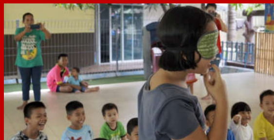
Above: Drama games to teach about using their senses.