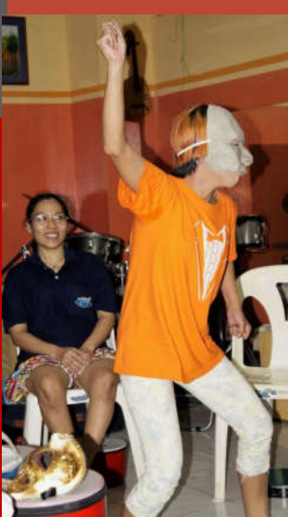
Above left and right: Using masks and hats to convey emotions and meaning. Left: Using props to tell a story.

We have had a very active week in Bangkok working with Central Thailand Mission's project partners -- the Thanksgiving Home (23 developmentally-challenged kids, needy youth), the House of Blessing (kids born in prisons or stigmatized/abandoned), and the Emergency Home (a protective shelter for those who have suffered from abuse, domestic violence, or rape). Our theme for our activities was "I Am". The goal was to instill a sense of self worth in the women and children. We used simple object lesson stories to illustrate various themes such as a bouncy ball to show resiliency (bouncing back), umbrella— protection, diamond—valuable, mirror—that they are beautiful.