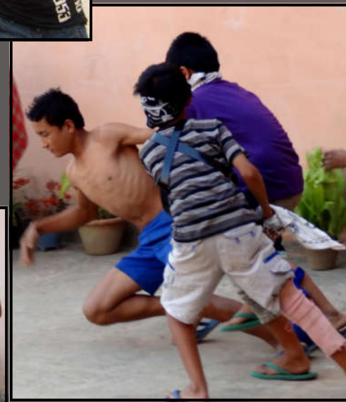
Right —acting out the story of the Good Samaritan.