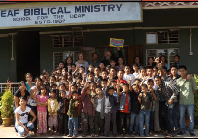
DEAF BIBLICAL MINISTRY SCHOOL FOR THE DEAF ESTD. 1987