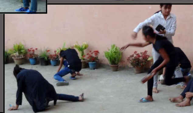
Below —happy and quick learners