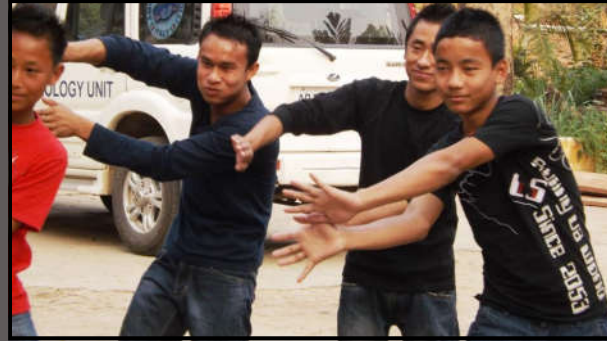
Above —learning mime technique to use space effectively to tell a story.