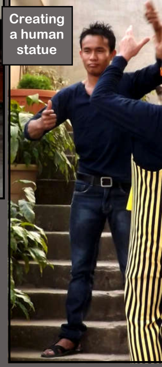
Creating a human statue