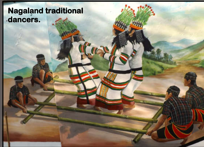
Nagaland traditional dancers.