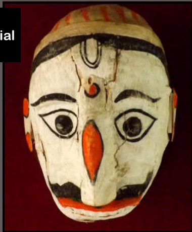
Naga Ceremonial mask