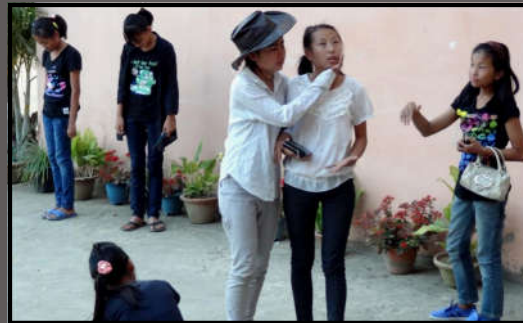
Left —critiquing the student’s performance of the parable story of The Good Samaritan.