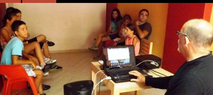
Using film clips to illustrate basic vital acting principles.

Learning to express emotions—such as fear and its opposite.