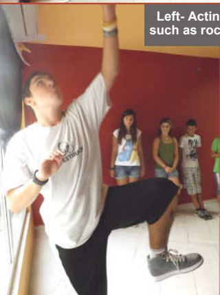
Left- Acting out special interests such as rock climbing for intros.

Our workshops in Eastern Europe have been enlightening. We have seen so much potential for dramatized story telling in these lands that are still in transition.