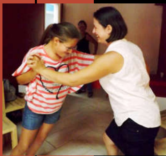
Every story needs conflict