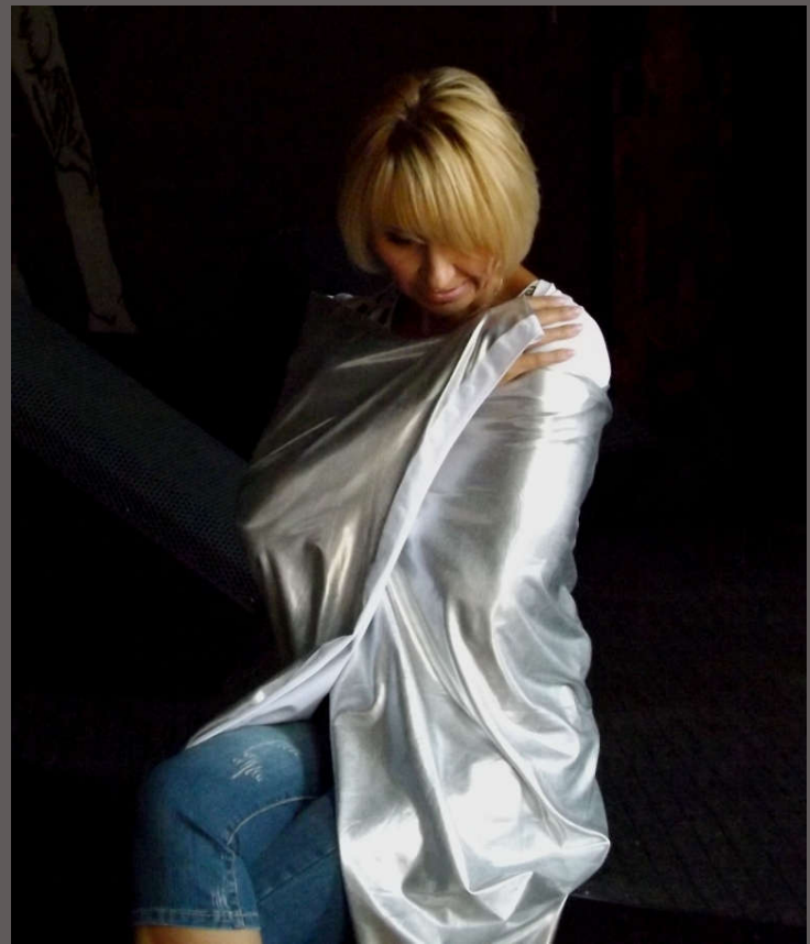
Acting out the 8th age of man (the after life) inspired by a Shakespeare play. This woman portrayed it as a butterfly.

I liked the workshop very much. It was very inspiring and fun. Especially the second day. It was great acting out the skits. I really liked the morph suit. It was really fun dressed in it. I really enjoyed myself, I hope you will come here and do this again. - Participant