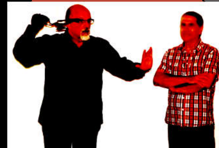
Using props to tell a story – here with a magic lamp.