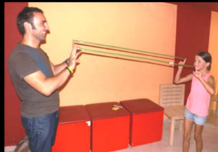
Learning cause and effect through games