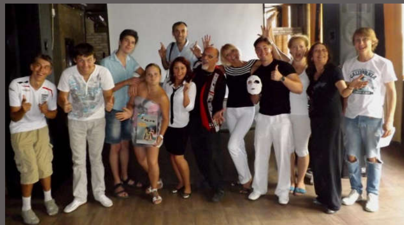
Mime workshop team in Sevastopol, Crimea, Ukraine. Aug.