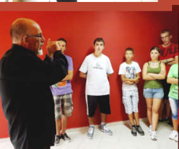
Critiquing helps to improve performances