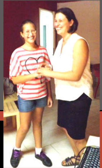
Mom and daughter having fun at the workshop.