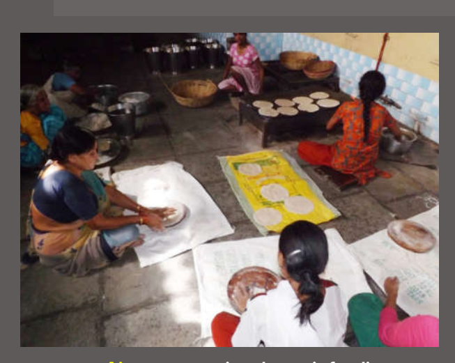
Above—preparing chapattis for dinner.

The Mukti Mission grows their own grains.