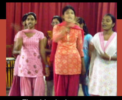
Above — The girls singing a song to end their parable performance.