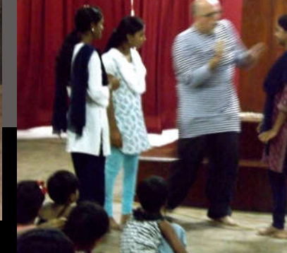
AT HAVE SEEN DEVA

Above—acting out the story of Adam and Eve in the Garden of Eden.