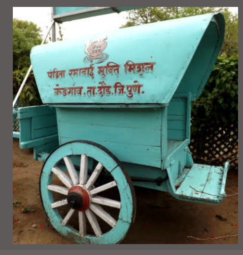
Pandita used this wagon to travel and help needy children and those in distress.