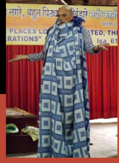
Above—acting out the David and Goliath story.