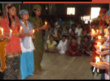
Acting out the parable of the Ten Wise/Foolish Virgins