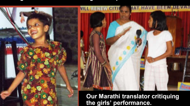
Bring a character to life using make up.