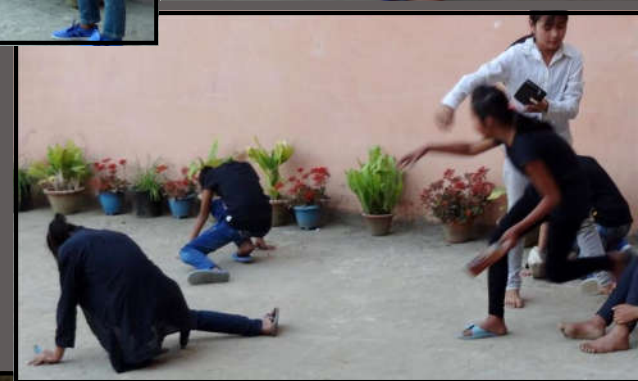
Below —happy and quick learners