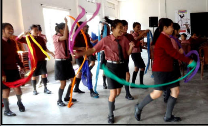
Above —using cloth to express emotion and movement